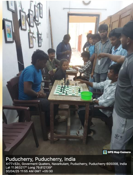
Puducherry, Puducherry, India Xr77+52c, Government Quarters, Navarkulam, Puducherry, Puducherry 605008, India Lat 11.963217° Long 79.812139° 30/04/25 11:55 AM GMT +05:30