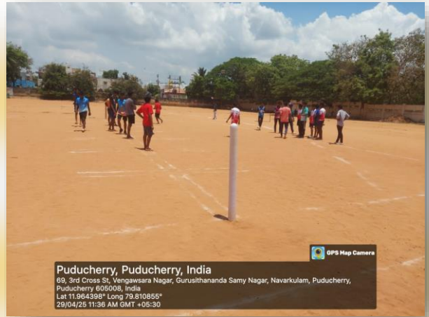
Puducherry, Puducherry, India 69, 3rd Cross St, Vengawsara Nagar, Gurusithananda Samy Nagar, Navarkulam, Puducherry, Puducherry 605008, India Lat 11.9643271° Long 79.810895° 29/04/25 11:36 AM GMT +05:30