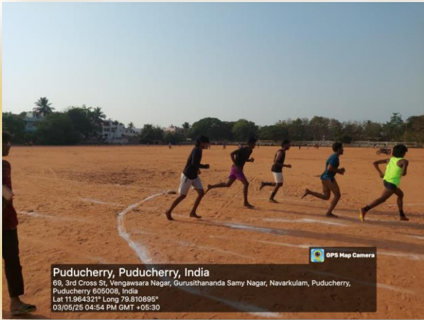
Puducherry, Puducherry, India 69, 3rd Cross St, Vengawsara Nagar, Gurusithananda Samy Nagar, Navarkulam, Puducherry, Puducherry 605008, India Lat 11.9643271° Long 79.810895° 03/05/25 04:54 PM GMT +05:30